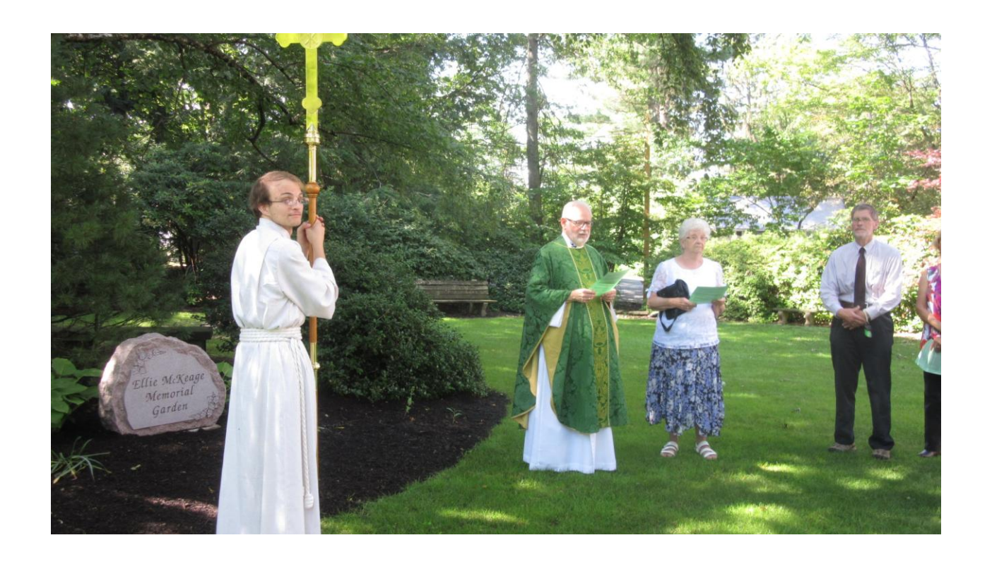
July 4th at St. Paul's

Tuesday was of course July 4th, and St. Paul's had a lot of activity. We opened our doors for visitors and our bathrooms for baby changing stations. As always, St. Paul's has a great view of the parade and chairs were set up on our sidewalk the night before. We rang our bell at 11:00 and our volunteers gave out water, candy and gave tours of our church. We had glorious weather and appreciative parents.