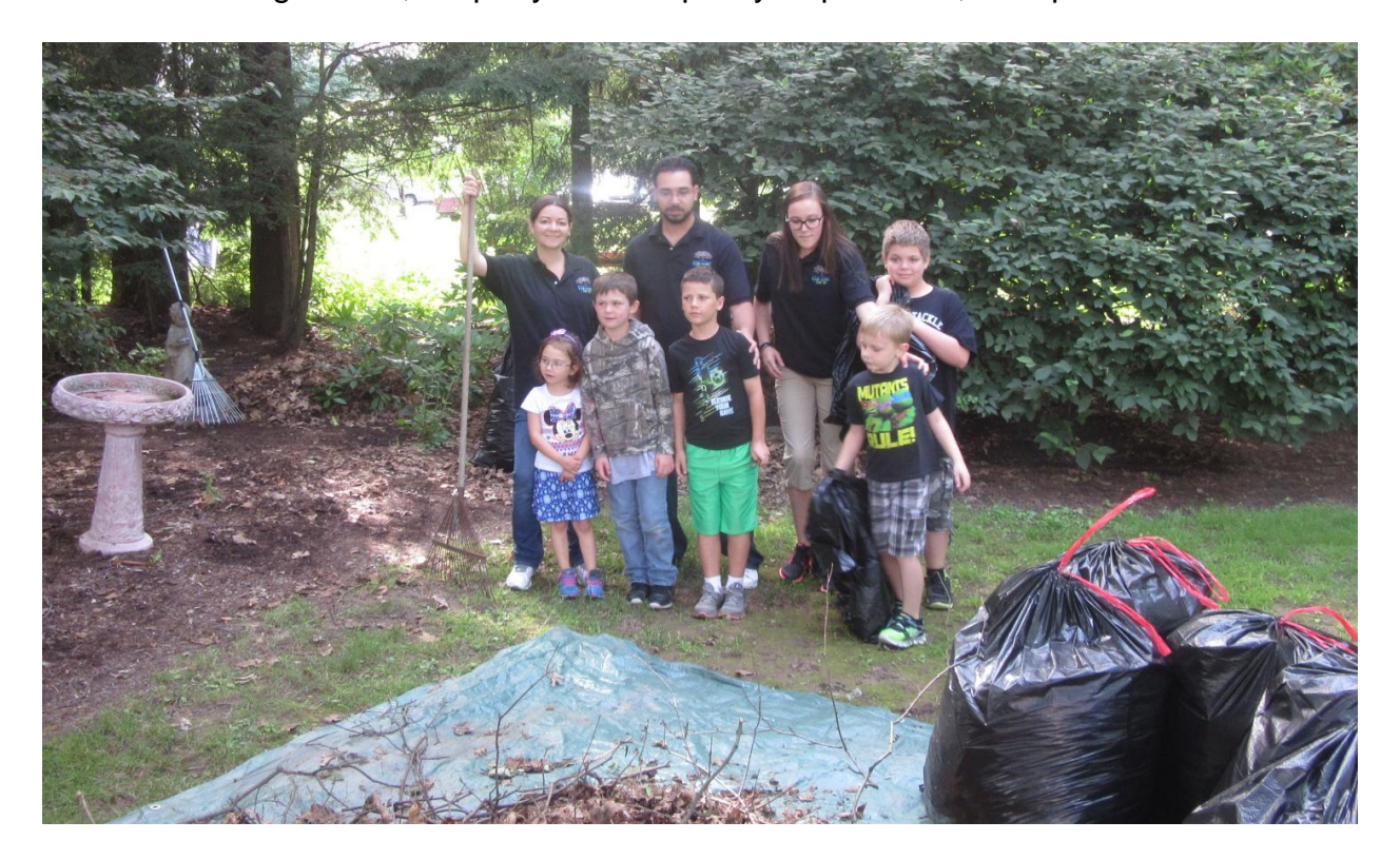
Property Gets Spruced Up

Kids From the Learning Center, Property Clean-Up Day Supervisors, Group Shot