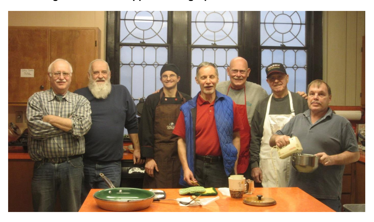
Quite a Crew - February 2017

Lent is fast approaching! St. Paul's Church is having its annual Shrove Tuesday pancake supper on Tuesday, February 25th, 2020, beginning at 5:30. The menu includes pancakes, eggs, sausage, applesauce, homemade desserts and beverages. Please come and join us and bring your friends. Mardi Gras costumes welcome!