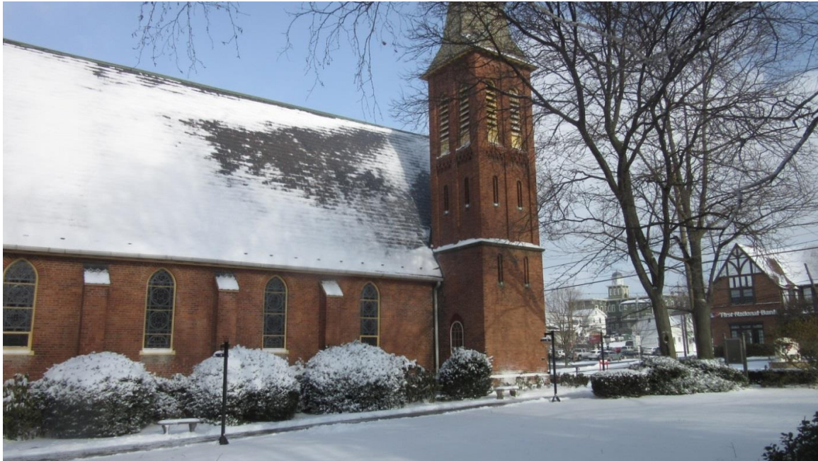
St. Paul's January 2016