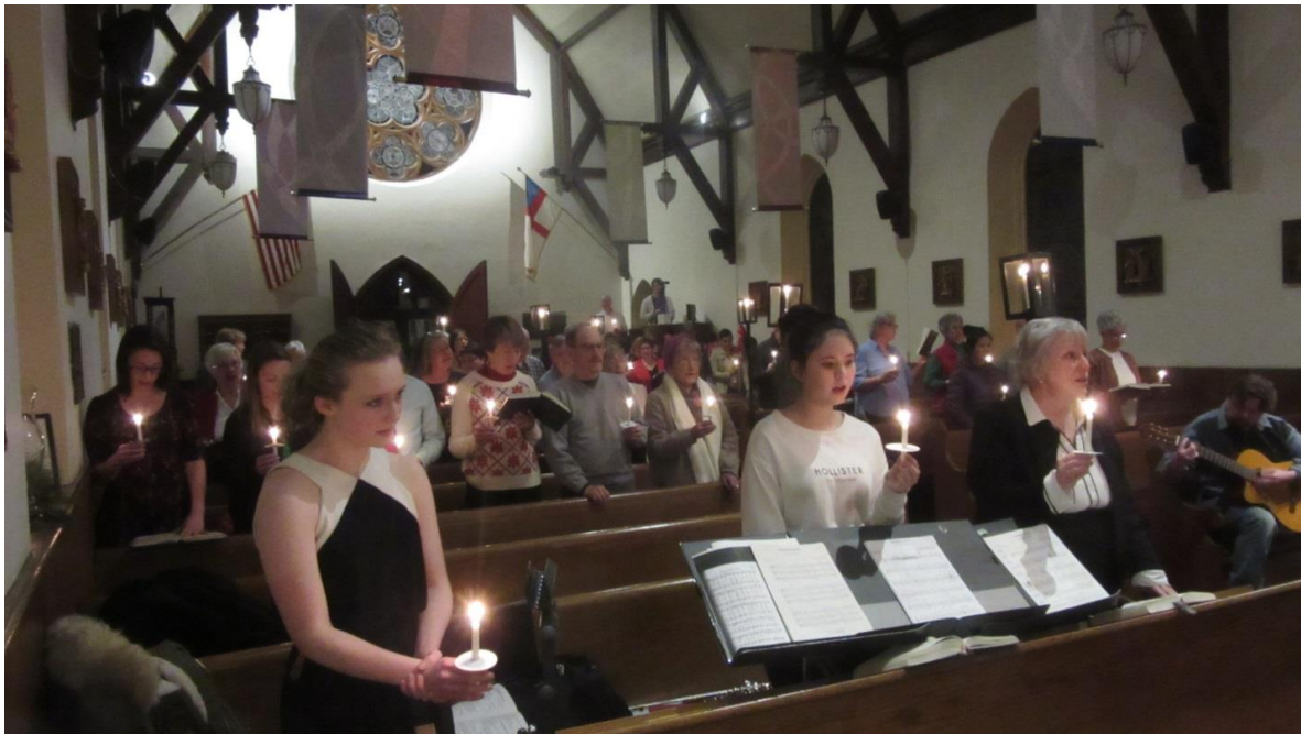
Christmas Eve Service 2017