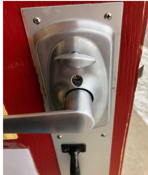
Door Will Stay Locked

The lock on the Chestnut Street door had to be replaced. The new one works a little differently than the old one. Getting in is the same – key in the code and turn the handle. When closing however, ON THE INSIDE , the knob above the handle must be horizontal for the door to lock OUTSIDE . If the knob is vertical, the door will stay unlocked outside. Check that the door is locked when you leave.