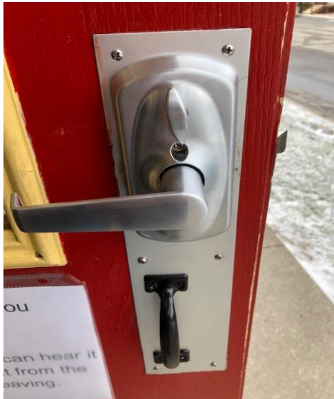
Door Will Stay Unlocked