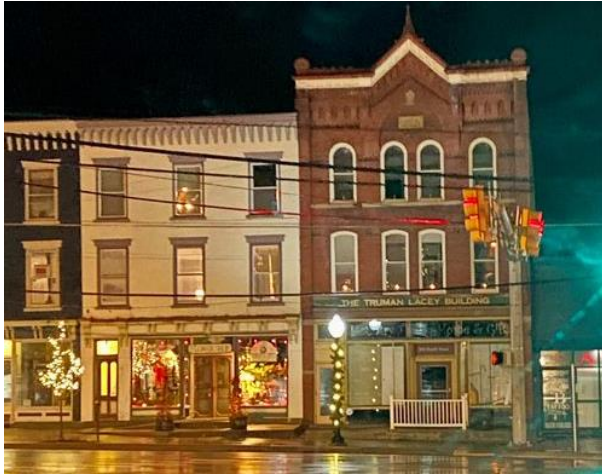
Montrose at Night - Tis the Season

It looks like putting up the Christmas decorations in Montrose that the St. Paul's parishioners helped with last week paid off. If you haven't been to town at night lately you may want to go in and have a look. St. Paul's looks pretty good at night also.