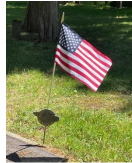
"VIEW FROM THE PEW"

I'm a veteran. I know this because the clerks at Lowe's give me a half-hearted "thank you for your service" when I use my card to get a 10% veteran's discount. Fifty years ago this week, I landed in Korea and spent fourteen months on the DMZ there. It seems hard to believe. Where do the years go?