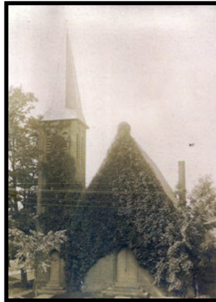
St. Paul's 2021, 1910

St. Paul's today is comprised of three separate connected buildings. They are managed by the Property Committee. The church was built in 1857, the parish hall to the east was built in 1927, and the center structure which connects the two containing offices and bathrooms was originally built in 1874 but rebuilt in 1927. A Memorial Garden and parking lot are located to the east of the church.