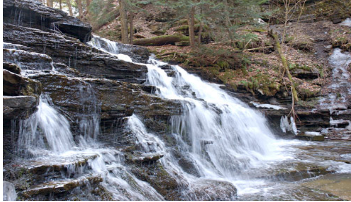
Salt Springs State Park

Our elevation: elevations range from 800 feet near the Susquehanna River to a high of 2,693 feet at Elk Mountain in the southeastern part of the County. The majority of the County is high and rolling with typical elevations above 1,500 feet.