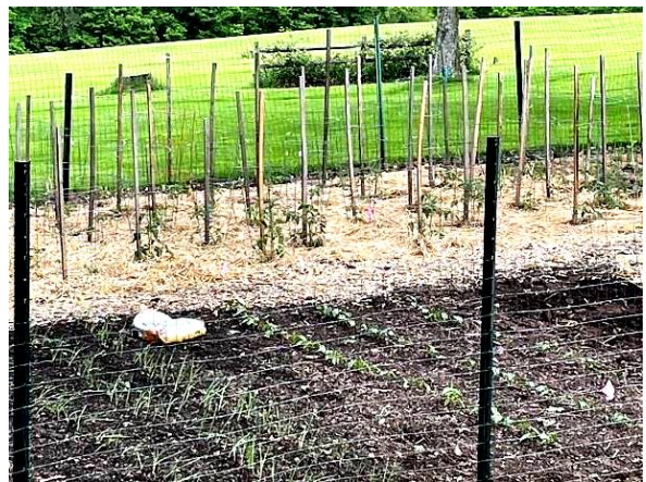
A Susquehanna Sunset