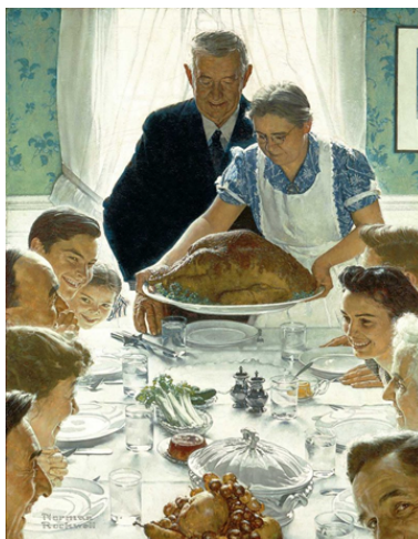
'Freedom from Want' by Norman Rockwell