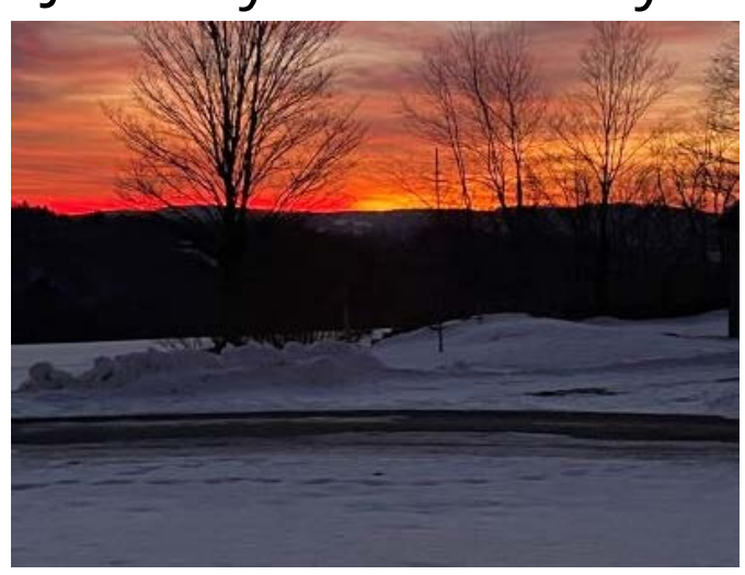
276 Church Street, Montrose, PA 18801

Office 570-278-2954, Monday-Thursday 8:15am-3:00pm Click on link to email St. Paul's: stpaulsmontrose@epix.net Click on link to go to our Website: http://stpaulschurchmontrose.org Click on link to go to our Facebook Page: https://www.facebook.com/stpaulsmontrose To proclaim God's love by word and example and to seek Christ in one another.